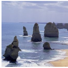
SUN 09 - 5 labels