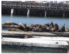
AwA - 29 labels