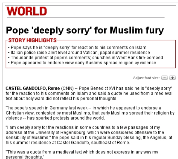
Figure 1: CNN.com screen shot of a story excerpt with highlights.

and purely statistical features from the document. The weights of the features are estimated using machine learning techniques, trained on an annotated corpus. In this paper, we focus on identifying the relevant sentences in the news article from which the highlights were generated. The system we have implemented is named AURUM: AUto-matic Retrieval of Unique information with Machine learning. A full system would also contain a sentence compression step (Knight and Marcu, 2000), but since both steps are largely independent of each other, existing sentence compression or simplification techniques can be applied to the sentences identified by our approach.