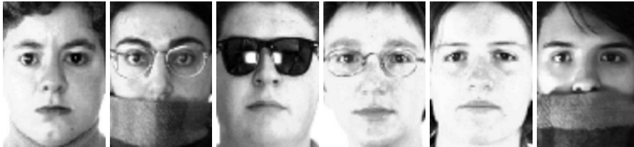
Figure 4: Images selected by KQBC. The last six faces for which KQBC queried for a label. Note that three of the images are saturated and that two of these are wearing a scarf that covers half of their faces.

We applied both KQBC and SVM to this dataset. We used the Gaussian kernel, such that the inner product between two images is defined to be K(x_1, x_2) = \exp\left(-\|x_1 - x_2\|^2 / 2\sigma^2\right) where \sigma was chosen to be \sigma = 3500 which is the value favorable by SVM. The results are presented in figure 3.