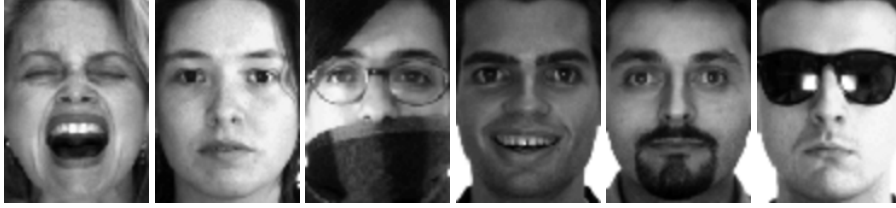
Figure 2: Examples of face images used for the face recognition task.